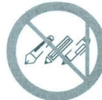
Pens or Pencils